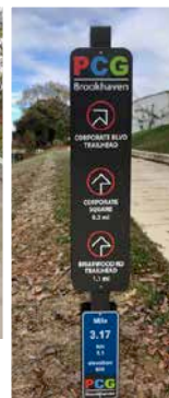
A signpost on the Peachtree Creek Greenway (PCG) in Brookhaven