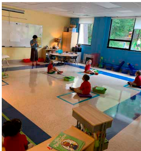
Another classroom at Shallowford Presbyterian School. A section of the outside play area is visible through the window.