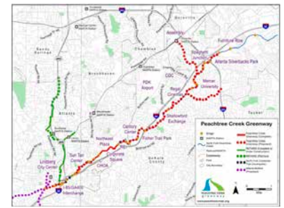
The Greenway will pass through the North Briarcliff Civic Association (NBCA) area to reach around Mercer University and connect with Doraville and other locations.

When will the Greenway reach the North Briarcliff Civic Association (NBCA) area? Brookhaven's next two miles of the Greenway are already being planned and funded, and all three miles should be completed within five years. The City of Chamblee has included the Greenway in their 2019