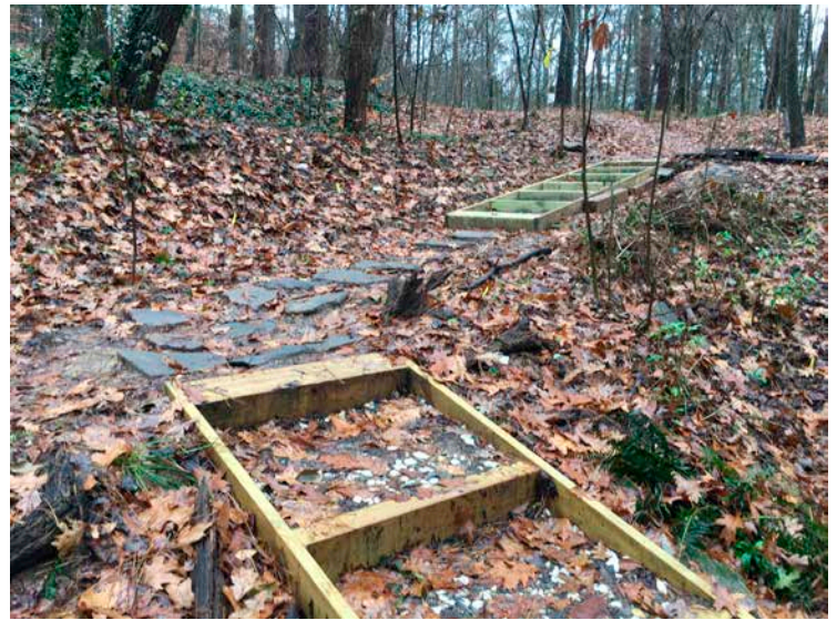
The two sets of stairs and paving stones

slide from the chimneys down to the creek. Instead, return to where the path divided and use the stairs to reach the creek.