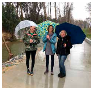
Friends enjoy walking along the trail beside the creek. CDC people from Corporate Square and staff from the Salvation Army Regional Headquarters enjoy “walking meetings” or breaks during the day.