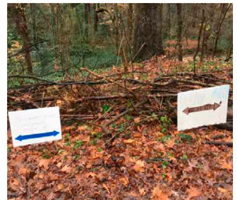
The barricade of signs and piles of brush

Please be a friend of the park. Do not scramble and