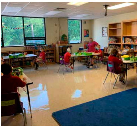
Shallowford Presbyterian School has small classes and enough room so that students maintain safe distances from each other in the classrooms.

Visit www.shallowfordschool.org for more information about the school, their COVID-19 safety protocols, and about enrolling your child for the 2021-22 school year!