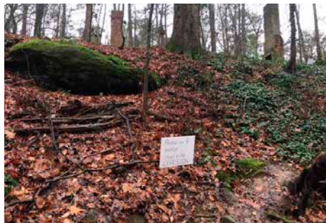
The two chimneys are in the background at the top of this steep hillside that is eroding because people trample the vegetation while sliding down to the creek.

When you go left to the chimneys , you reach the two old chimneys, which are at the top of a steep slope. The hillside is eroding because people have been trampling and sliding down the hillside to the creek. Friends of the Park have erected barricades of brush and posted signs (in several languages) beside the chimney to discourage people from scrambling from the chimneys down to the creek.