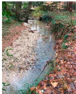
Mary Scott Creek flows through the northern portion of the park.