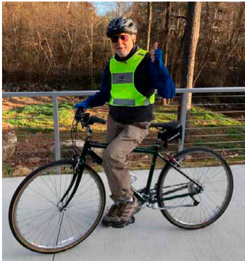
People really enjoy being able to bike without fighting Atlanta traffic and breathing exhaust.

What is the Peachtree Creek Greenway? Who will use it? The Peachtree Creek Greenway is a free, public multi-use trail. “Multi-use” means a paved surface for many different users: walkers, runners, bicyclists, stroller-pushers, shoppers, dog walkers, and commuters. Families recognize the value of having a safe, non-car place for children to learn to ride a bike or sharpen their scooter skills. Visitors love walking along the North Fork of Peachtree Creek, listening to birds and taking a respite from their busy lives. Handicap parking places, ramps, concrete paving, and frequent park benches allow those with limited mobility to enjoy this peaceful, linear park.