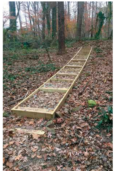
The stairs are located on a gentle slope that makes it easy and safe to reach the creek.

Help maintain and restore the park. Come join volunteers from the Georgia Native Plants Society (GNPS) and Friends of the Park who meet for two hours the first Saturday of every month (at 2pm in the winter or 10am in the warmer months) to remove invasive nonnative plants and establish more native plants. We practice safe procedures by wearing masks and maintaining social distance between workers. Bring your gardening gloves, a trowel, and any questions you have about native and nonnative plants.