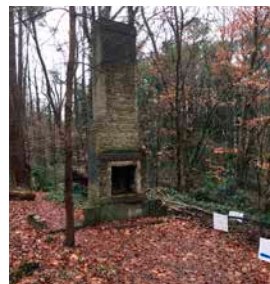
Signs and piles of brush on the right side of the chimney are designed to discourage people from sliding down from the chimneys to the creek.