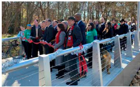
Brookhaven's official opening of the Peachtree Creek Greenway December 12, 2019

Where is the Peachtree Creek Greenway now? Brookhaven completed the first 1.3 mile section of the Greenway a year ago. This section extends from Briarwood Road (near REI), underneath Corporate Boulevard, to North Druid Hills Road (near the Salvation Army headquarters and the I-85 Expressway). The Briarwood Road trailhead is only 0.6 miles from the intersection of Clairmont Road and I-85.