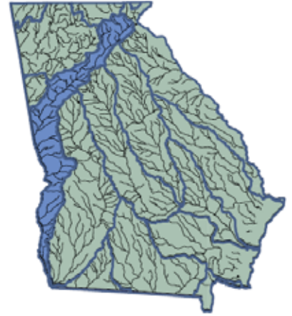
Chattahoochee River Basin

We know that we are under strict watering restrictions. Read details via the link on the main page at www.northbriarcliff.org . Legislation which would require homeowners to replace toilets and restrict water flow from showerheads and faucets prior to sale of their homes has been proposed (not enacted as of Jan 1) at the county level. Legislation to make water-saving plumbing fixtures eligible for the state's sales tax holidays program is being proposed this winter. As some neighbors (myself included) feel the push to replace that old toilet while they still have time to enjoy it, NBCA is wondering whether there are ways we might band together as a neighborhood to get better deals on toilet replacement, maybe by having a plumber do a number of toilets on a street or series of streets during one day's work and haul off the debris as a joint effort. If you talk to your neighbors and find that a number of you do want to do this or you know of a good plumber who might be just the person to call for such a group-job, let NBCA know, so we can spread the knowledge. Maybe I can help coordinate it: contact me at parks@northbriarcliff.org .